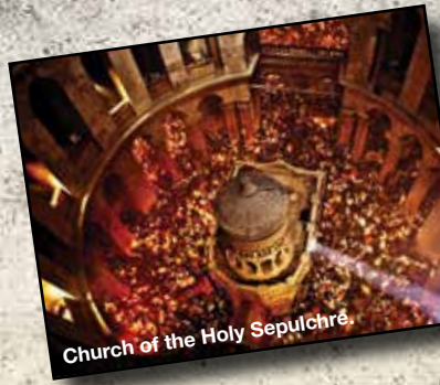
Church of the Holy Sepulchre.

Church of the Holy Sepulchre: Ok, not on the stone, but not far from it. The church is built over a rocky hill where many Christians believe Jesus was crucified, buried and resurrected.